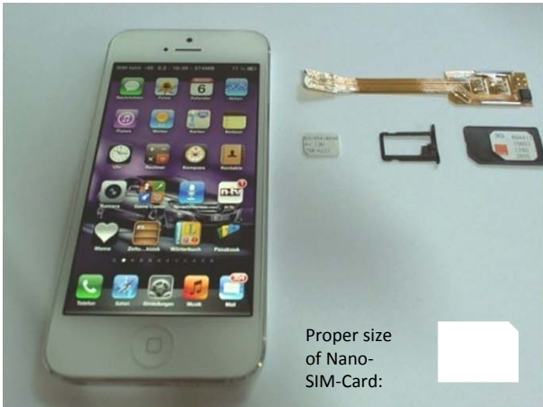
Proper size of Nano-SIM-Card: